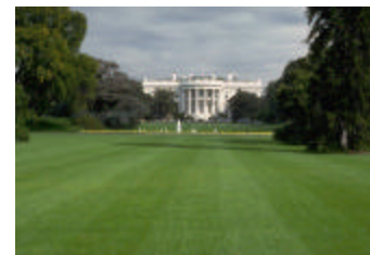
Washington, D.C.—NAFUSA Annual Conference September 5-7, 2002